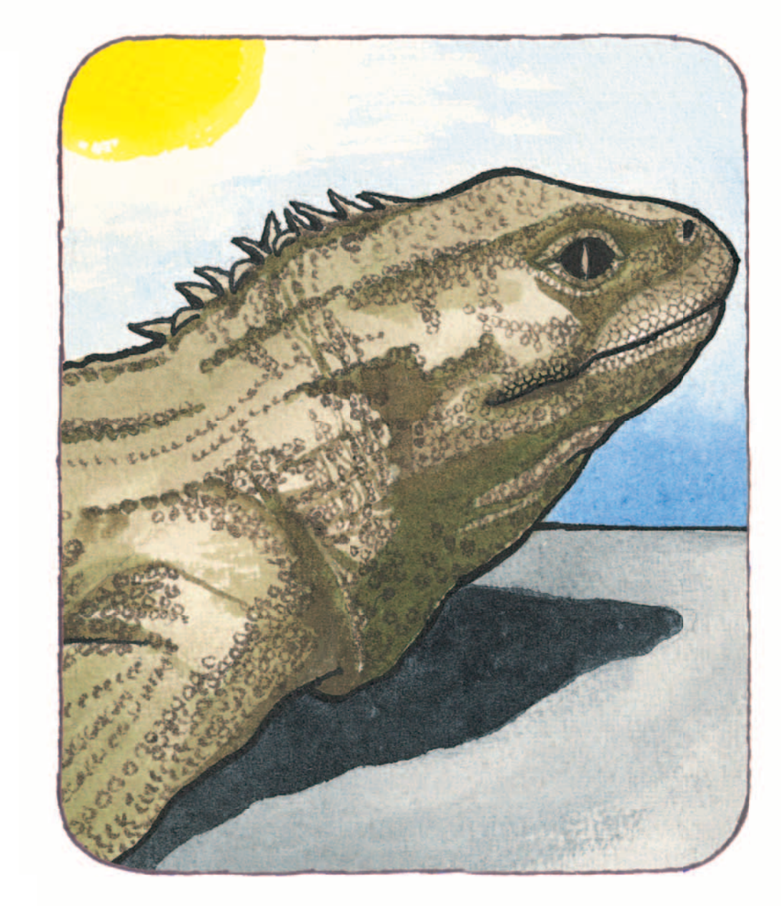
He sat and sat and sat.