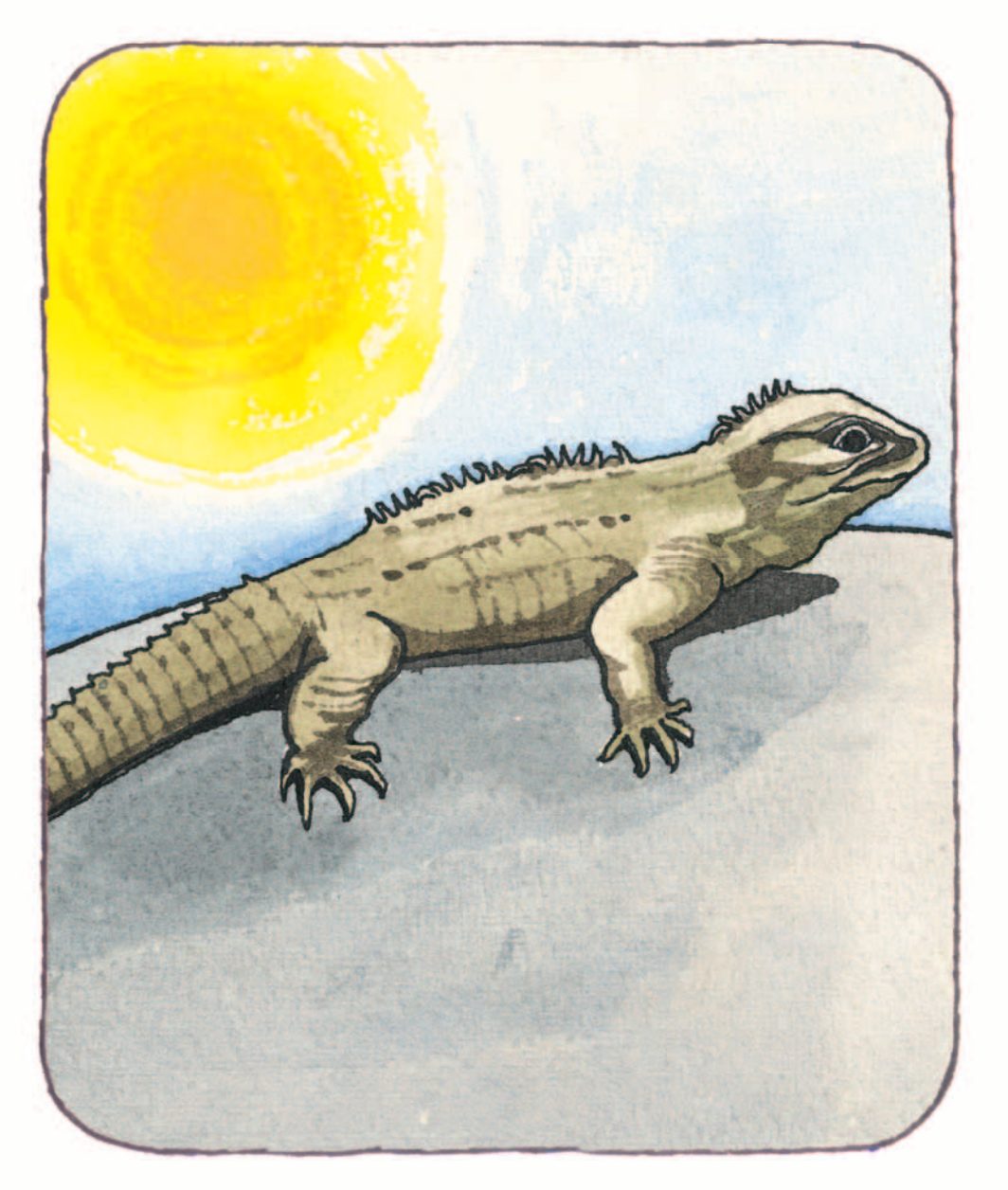
Old Tuatara sat in the sun.